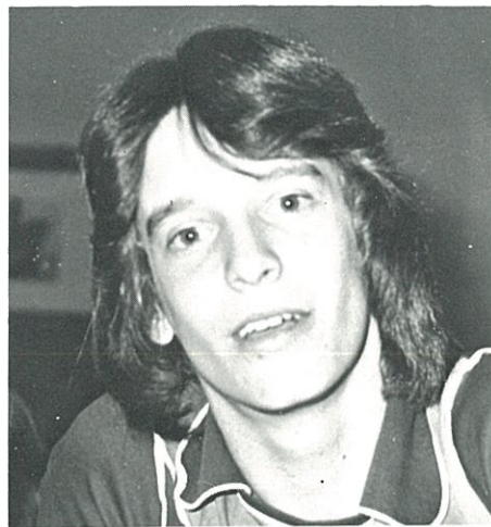
A happy smile.