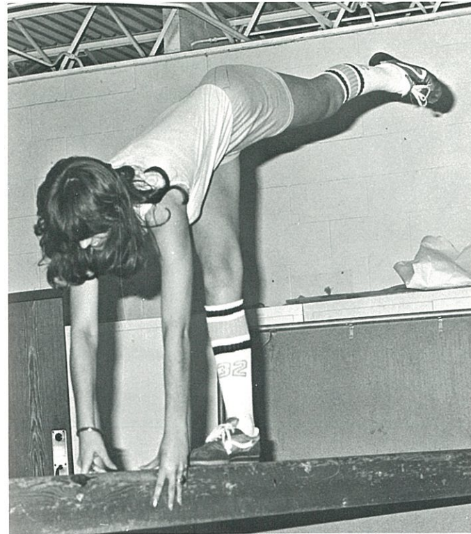
Work on that balance beam!