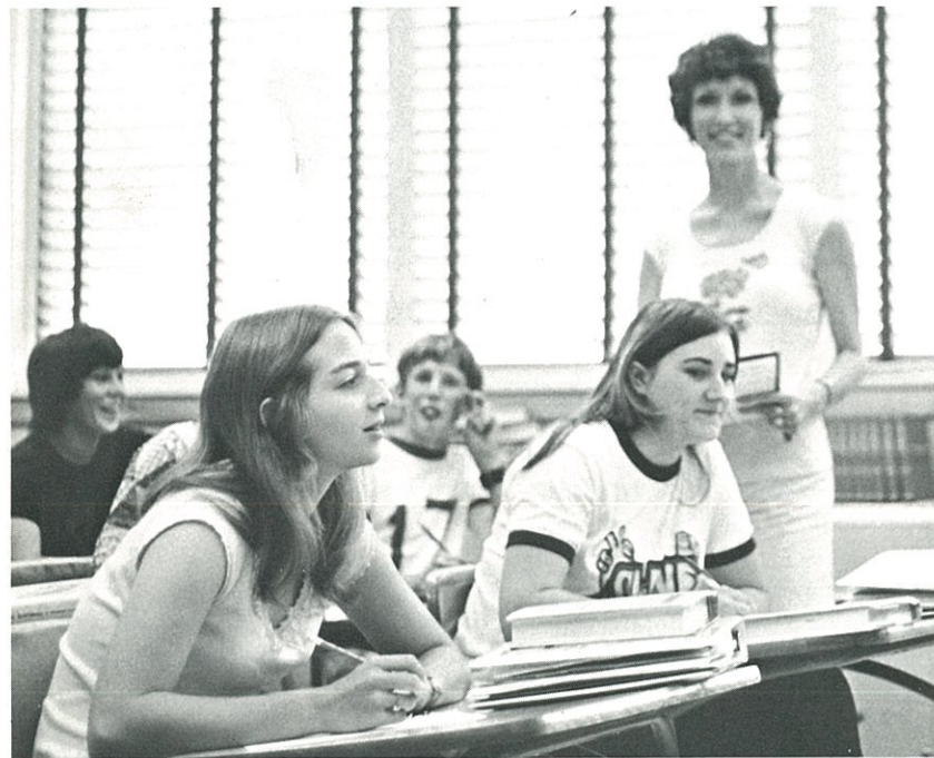
And the next word is...