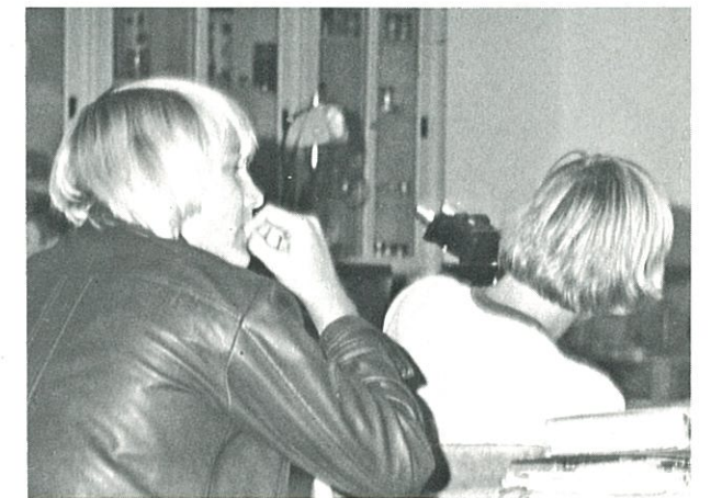
What is the answer?