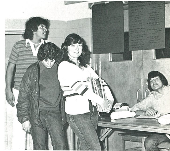
Be my valentine.