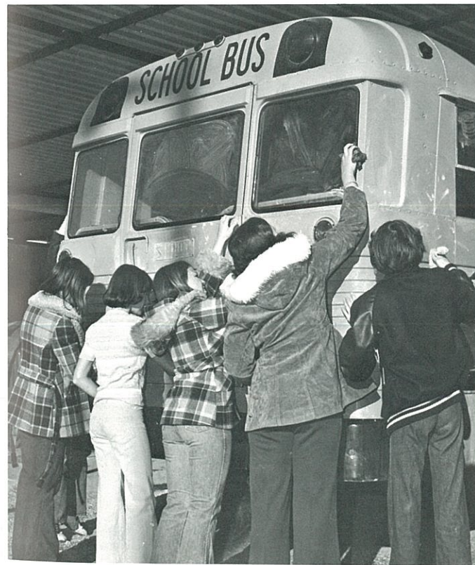
Wash that bus.