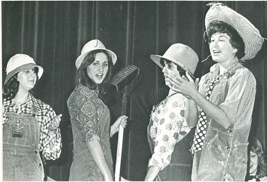
What kind of farmers are these?